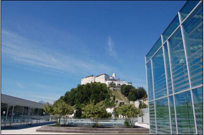
The University of Salzburg (provided by the Symposium organisers)

All topics dealing with moral and democratic education are welcome – including those not addressing the main theme of the conference specifically.