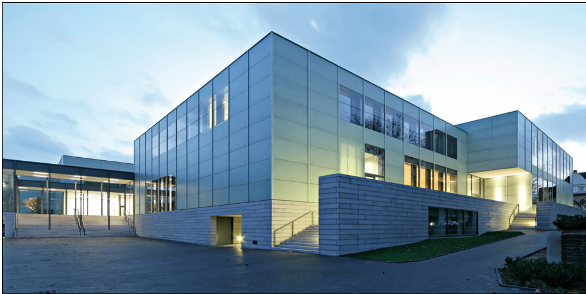
Essen, The Folkwang Museum