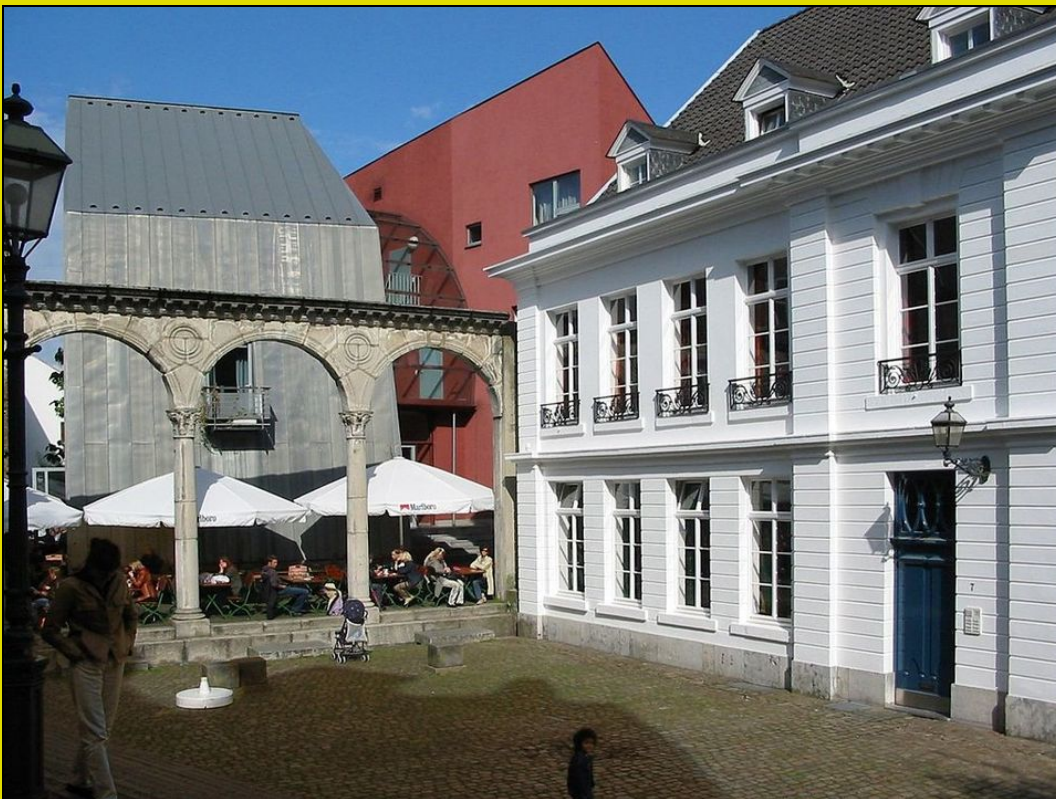
Aachen, Römerarkaden