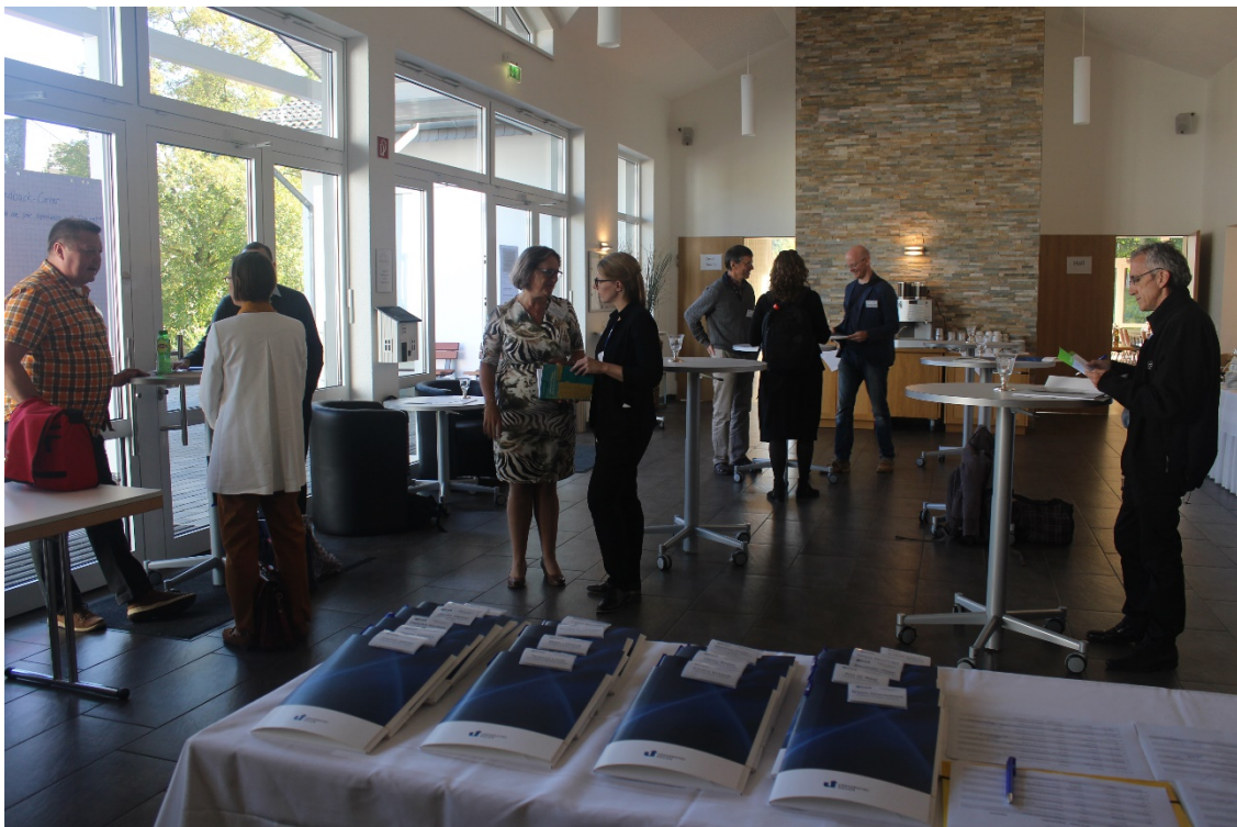
Welcome to SIG 19 Conference