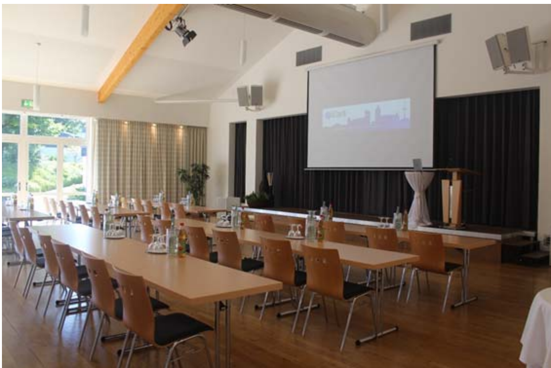
Conference Room at Haus Patmos, Siegen (Germany)