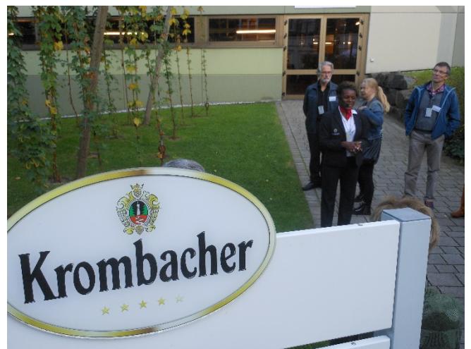
German Dinner at Krombacher Brewery