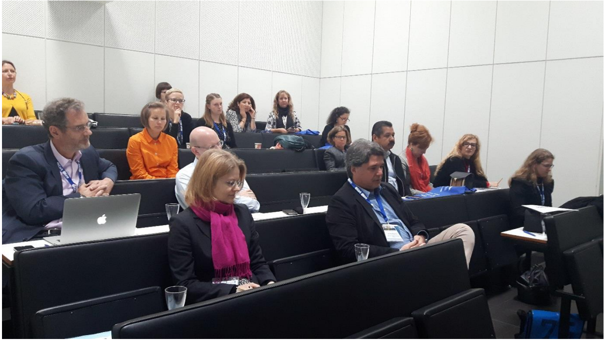
SIG 19 Symposium 2017