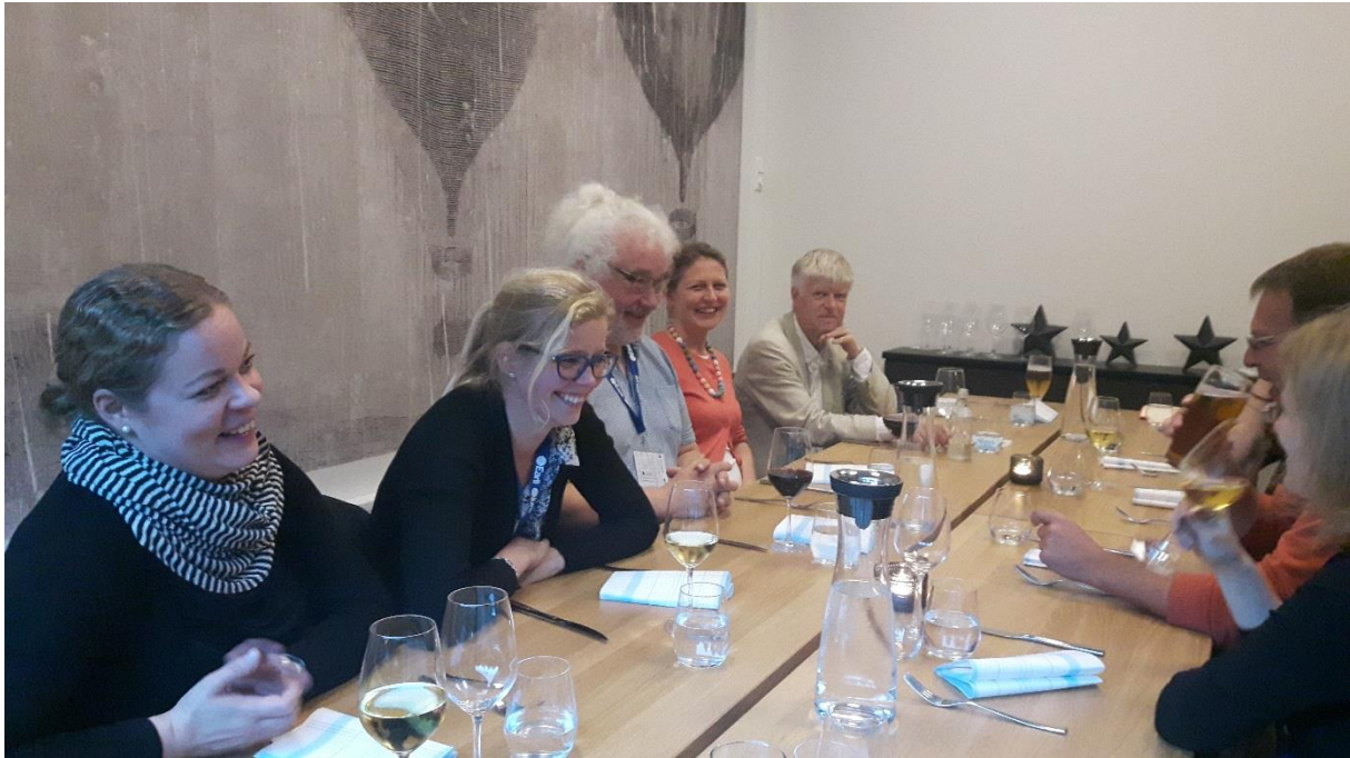
SIG 19 Dinner