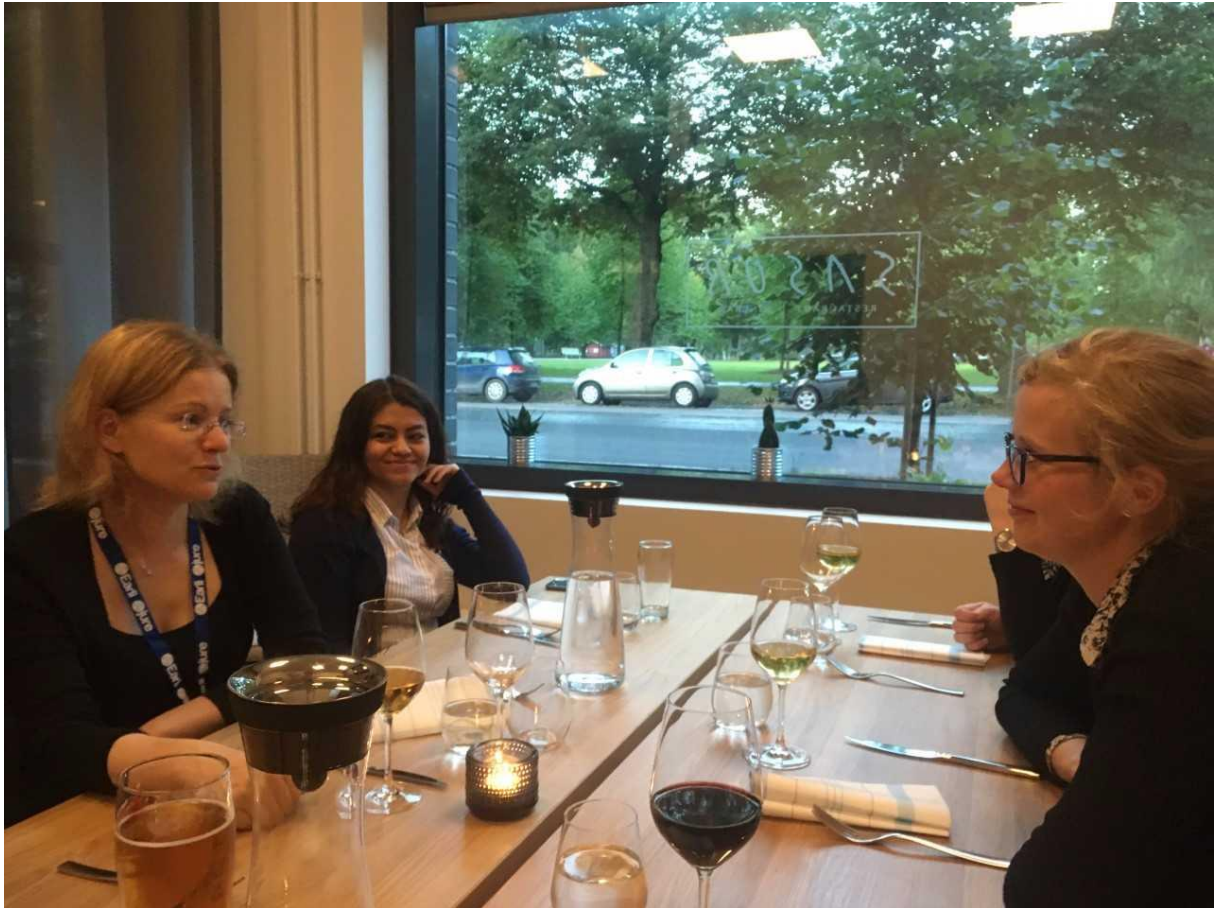
SIG 19 Dinner