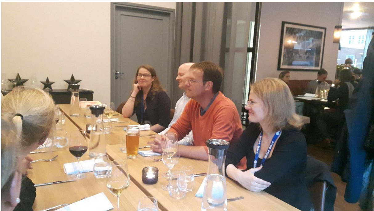
SIG 19 Dinner