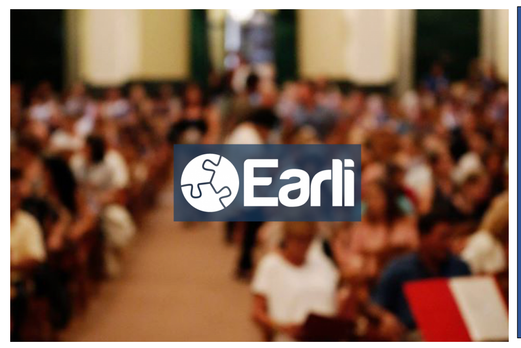
SIG 9 Phenomenography and Variation Theory